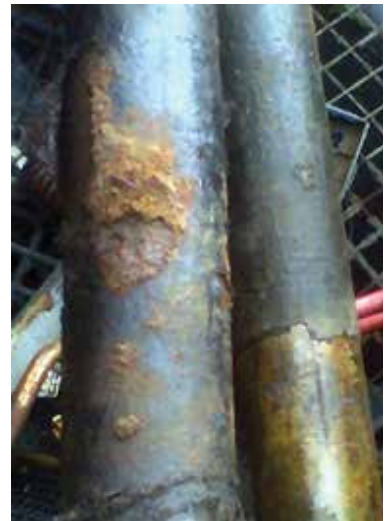
Figure 5: Double-bottom hole-type cylinder in PVC sleeve to prevent ground moisture from coming in contact with cylinder