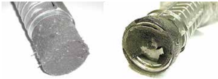
Figure 3: Clogging of pump filters