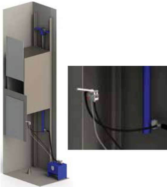
Figure 6: Emergency rescue using an MRL-H rescue unit

subassemblies of such accessories are often made up of mild steel. A common mistake would be to operate the elevator by pumping it with a hand pump with contaminated oil. Doing this would contaminate the complete circuit. Using an appropriate filter at the hand-pump suction port is very important and always advisable.