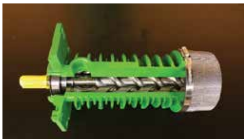
Figure 4: Section view of a submersible screw pump

should not be started to prevent the complete hydraulic circuit from getting contaminated.