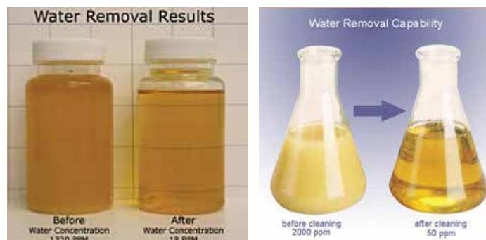
Figure 1: Comparisons of hydraulic oil mixed with water

EW Continuing Education is currently approved in the following states: AL, AR, FL, GA, IL, IN, KY, MS, MT, OK, PA, VT, VA, WV and WI. Please check for specific course verification of approval at www.elevatorbooks.com .